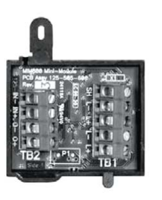
Fig. 1 EV-Mini IP Mini-Input Module