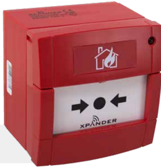
XPA-MC-14006-APO XPander Manual Call Point