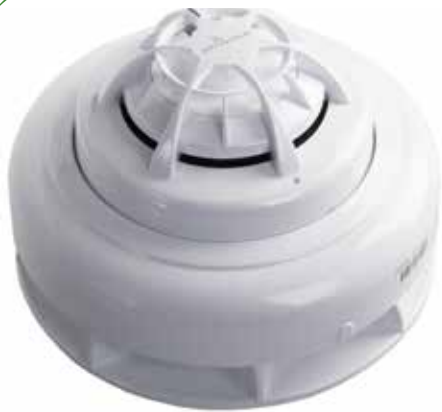
XPAN-CB-14019-APO XPander Combined Sounder and Multisensor Detector