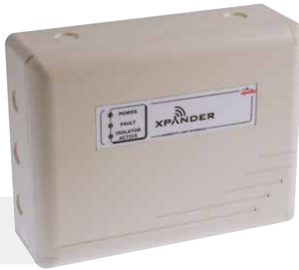
XPA-IN-14050-APO XPander Diversity Loop Interface