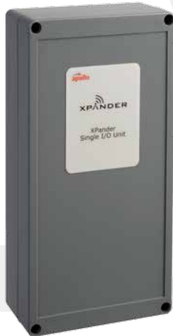
XPA-IN-14011-APO XPander Input/Output Unit