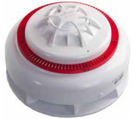
XPAN-CB-14021-APO Combined Sounder Visual Indicator (Red) and Heat Smoke Detector