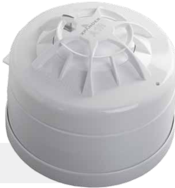
A1R XPA-CB-11170-APO CS XPA-CB-11171-APO

XPander Heat Detector with Radio Mounting Base