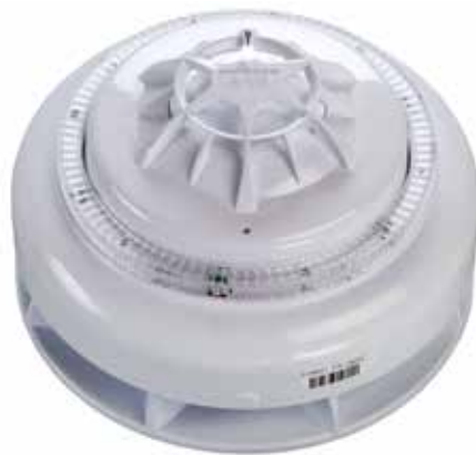
XPAN-CB-14025-APO XPander Combined Sounder Visual Indicator (Clear) and Heat Detector (Class A1R)